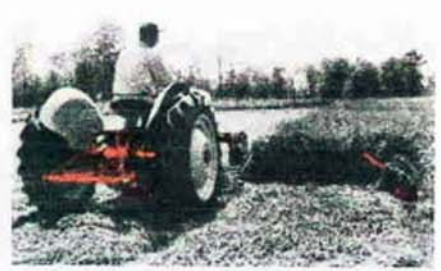
Dearborn Side-Mounted Mower

This implement is designed for curb or highway mowing. Good, too, for large hay farms, especially heavy stands.